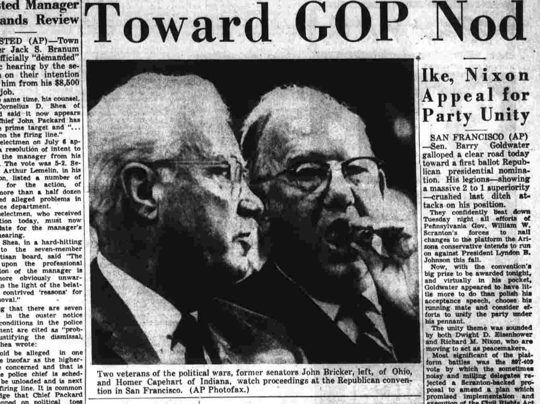
Two veterans of the political wars, former senators John Bricker, left, of Ohio, and Homer Capehart of Indiana, walk proceedings at the Republican convention in San Francisco.

Scranton Defeated 2 to 1 on Planks. PHILADELPHIA (AP)—The Republican convention delegates who met in the Cow Palace today to cast the 16 votes into the poll which looks like a Barry Goldwater steamroller.